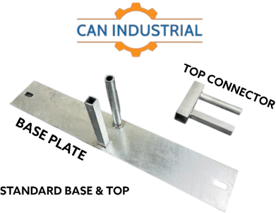
STANDARD BASE & TOP